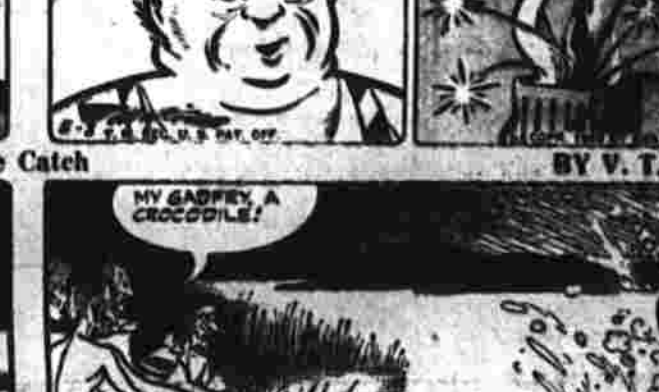
BY MERRILL C. HLOSSEN